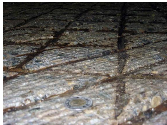
Poor floor imprint repaired by AGRI-TRAC .

·So, sit back, reach for a refreshing drink, and enjoy the conversation