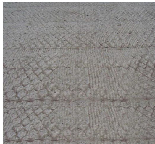
Closeup of a bad imprint after repair by AGRI-TRAC .